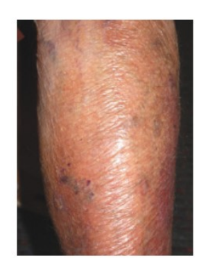
Figures: Steroid-induced striae (left) and Steroid-induced skin atrophy (right)