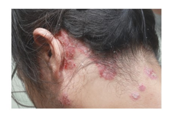
Figures: Scalp Psoriasis Source: DermNet (left)