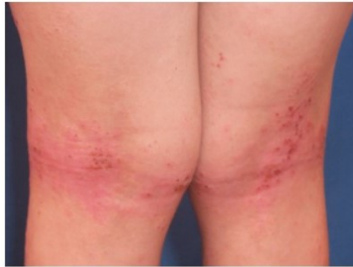
Figures: Atopic Dermatitis