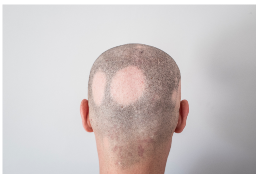
Figure: Alopecia Areata

Alopecia areata is an autoimmune condition that affects about 1 in 500 adults. In alopecia areata, the immune system attacks the body's own hair follicles—leading to patches of hair loss on the scalp, face, and other areas of the body. Typically, these bald patches appear suddenly and in some patients, can involve the whole body. Recurrence is common and most sufferers will have several episodes during their lifetimes. A small percentage of patients have persistent hair loss even with treatment. Alopecia areata has been shown to lead to significant psychosocial impacts in patients, negatively impacting self-esteem, body image, and/or self-confidence.