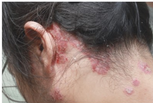
Figures: Scalp Psoriasis