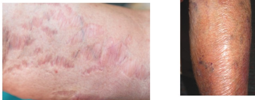
Figures: Steroid-induced striae (left) and Steroid-induced skin atrophy (right)