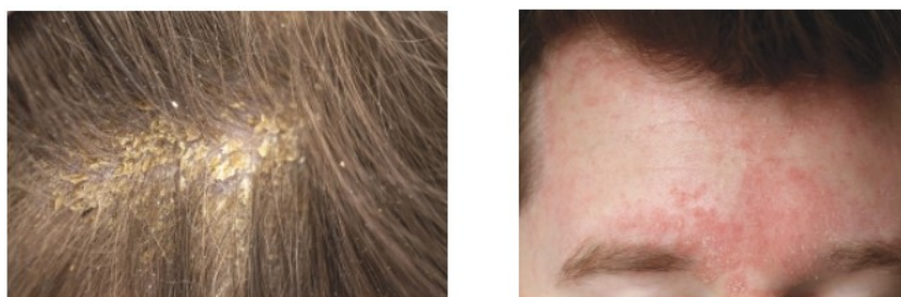
Figures: Seborrheic Dermatitis

Seborrheic dermatitis is a common skin disease that is estimated to occur in more than 10 million people in the United States. The disease causes red patches covered with large, greasy, flaking yellow-gray scales, and is frequently itchy. It appears most often on the scalp, face (especially on the nose, eyebrows, ears, and eyelids), upper chest, and back as depicted in the figures below. While the pathogenesis of seborrheic dermatitis is not well understood, it is an inflammatory disease of the skin distinct from atopic dermatitis and psoriasis, it shares some features such as a skin barrier defect with atopic dermatitis and some inflammatory pathways in common with psoriasis. Seborrheic dermatitis is associated with an over-abundance of Malassezia , a naturally occurring yeast found on normal skin but found in excess numbers on skin with seborrheic dermatitis where it may exacerbate the underlying skin inflammation that leads to the signs and symptoms well characterized in the disease. Seborrheic dermatitis can occur in adults, adolescents and infants, and in infants is commonly referred to as “cradle cap”.