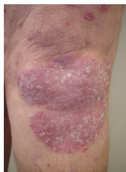
Figures: Plaque Psoriasis