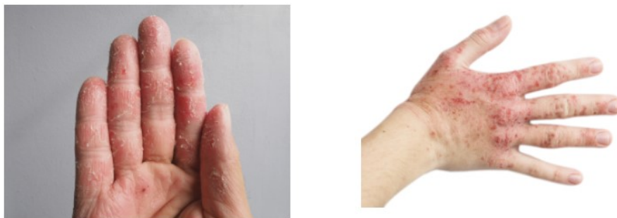
Figures: Hand Eczema