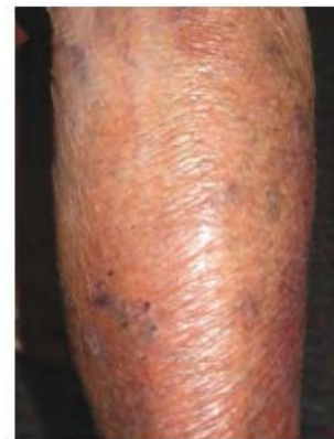
Figures: Steroid-induced striae (left) and Steroid-induced skin atrophy (right)