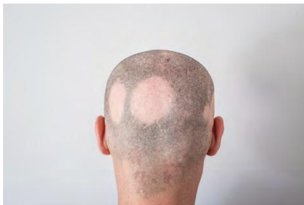
Figure: Alopecia Areata

Alopecia areata is an autoimmune condition that affects about 1 in 500 adults. In alopecia areata, the immune system attacks the body's own hair follicles—leading to patches of hair loss on the scalp, face, and other areas of the body. Typically, these bald patches appear suddenly and in some patients, can involve the whole body. Recurrence is common and most sufferers will have several episodes during their lifetimes. A small percentage of patients have persistent hair loss even with treatment. Alopecia areata has been shown to lead to significant psychosocial impacts in patients, negatively impacting self-esteem, body image, and/or self-confidence.