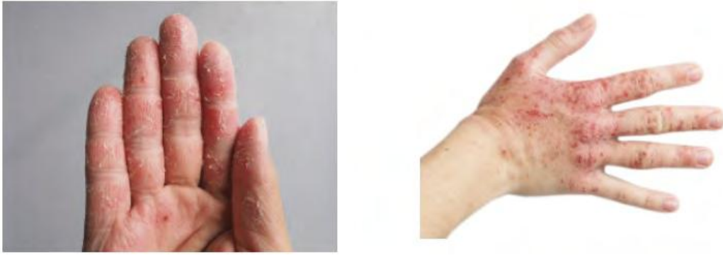
Figures: Hand Eczema