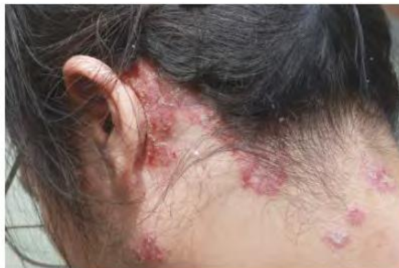
Figures: Scalp Psoriasis