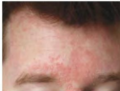
Figures: Seborrheic Dermatitis