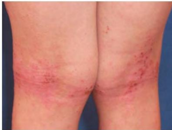
Figures: Atopic Dermatitis

Atopic dermatitis is the most common type of eczema, affecting approximately 26 million people in the United States. Atopic dermatitis is the most common skin disease among children, with prevalence steadily increasing from 8% to 12% in the last two decades. Atopic dermatitis is characterized by a defect in the skin barrier, which allows allergens and other irritants to enter the skin, leading to an immune reaction and inflammation. This reaction produces a red, itchy rash, most frequently occurring on the face, arms and legs, and the rash can cover significant areas of the body (see figures below). The rash causes significant pruritus (itching), which can lead to damage caused by scratching or rubbing and perpetuating an 'itch-scratch' cycle.