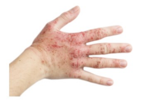
Figures: Hand Eczema