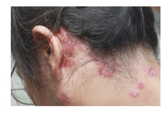
Figures: Scalp Psoriasis Source: DermNet (left)