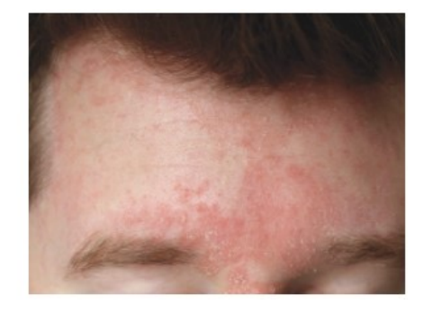
Figures: Seborrheic Dermatitis