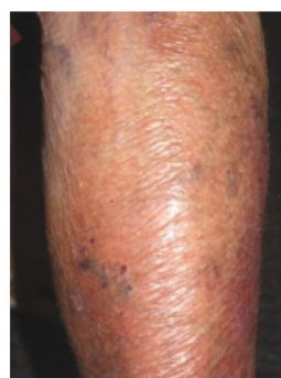
Figures: Steroid-induced striae (left) and Steroid-induced skin atrophy (right)