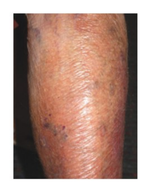
Figures: Steroid-induced striae (left) and Steroid-induced skin atrophy (right)