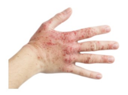
Figures: Hand Eczema